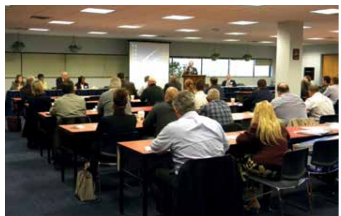
The Safety Symposium held on April 30, 20124.